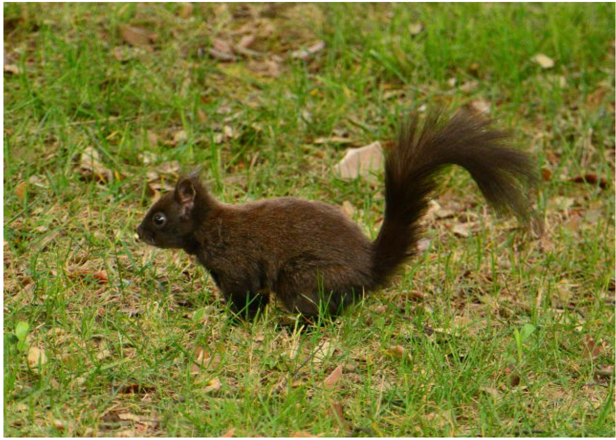
Red Squirrels in hotel grounds