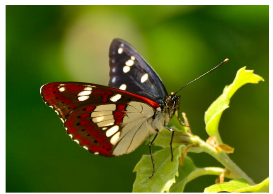
Southern White Admiral