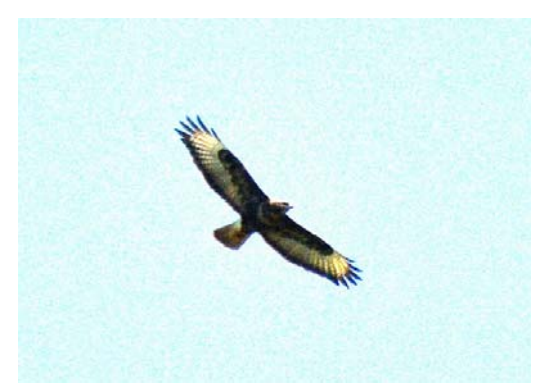
Long-legged Buzzard (record shot)