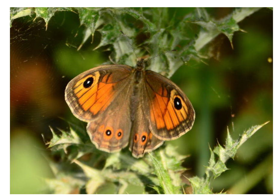
Large Wall Brown