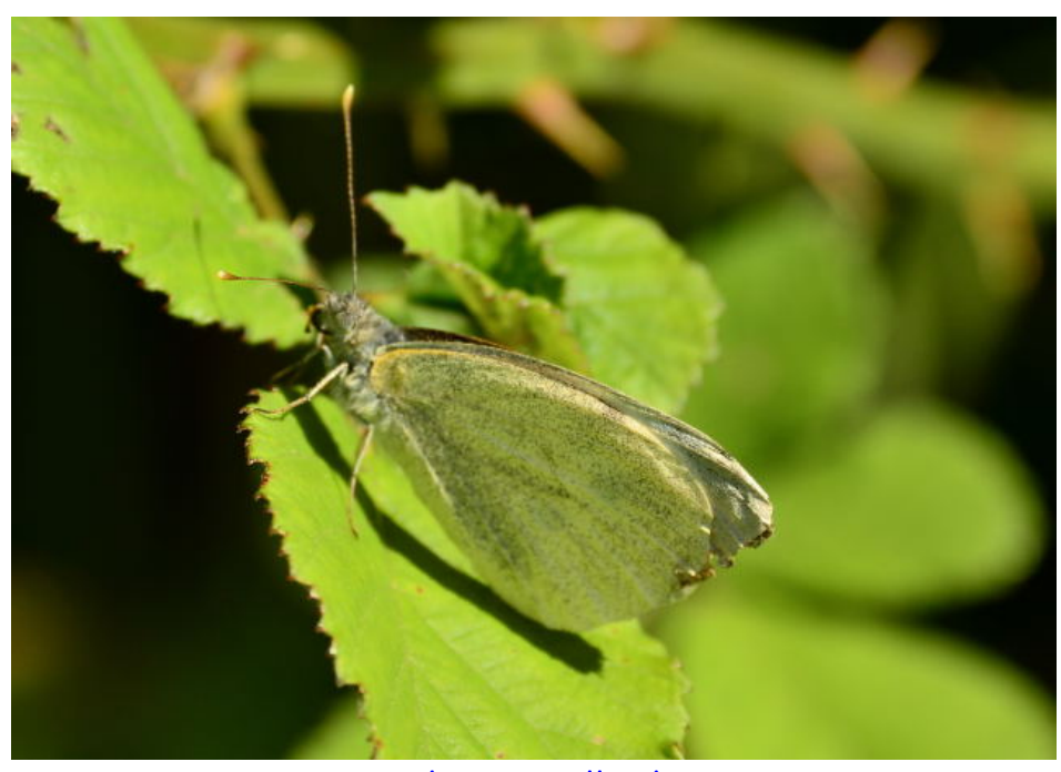
Southern Small White